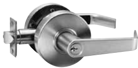
ENTRY ENTRANCE/OFFICE INSIDE TURN BUTTON