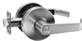
PRIVACY RESTROOM INSIDE TURN BUTTON