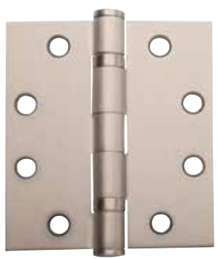
BALL BEARING BUTT HINGE