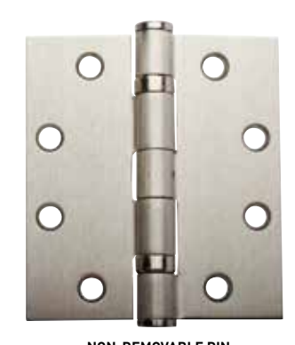
NON-REMOVABLE PIN BALL BEARING BUTT HINGE