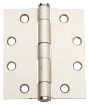
PLAIN BEARING BUTT HINGE